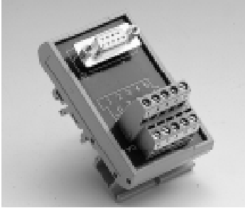
ADAM-3909 DB-9 Wiring Terminal for DIN-rail Mounting

The ADAM-3900 series consists of universal screw terminal modules designed for field signal wiring in industrial applications. They can be connected to the analog and digital ports of Advantech products such as the PCL series.