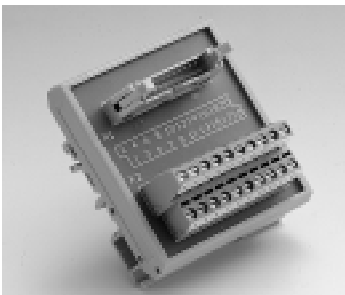
ADAM-3920 20-pin Flat Cable Wiring Terminal for DIN-rail Mounting