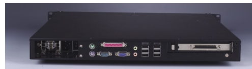
200W ATX PFC P/S & rear panel of motherboard version