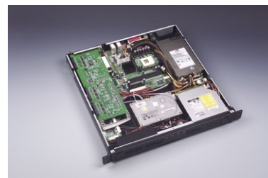
Supports one full-length 32-bit PCI expansion