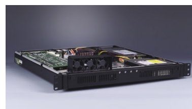
Three filtered 10-CFM cooling fans on front-end